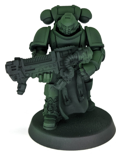
3 Using the airbrush, apply a first highlight on the upper parts of the figure with a mixture of equal parts of Game Air Dark Green 72.728 and Game Air Sick Green 72.729.