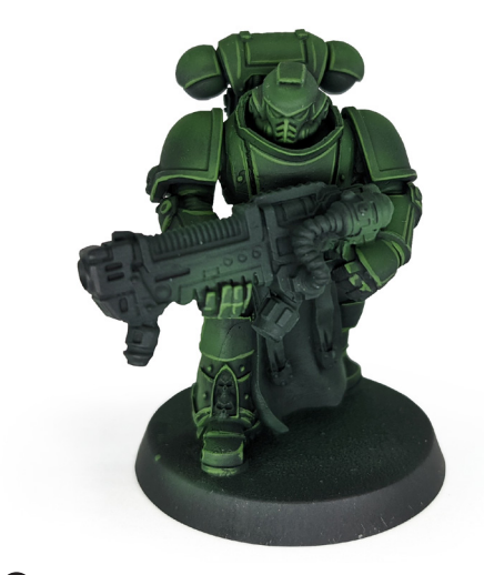
Outline the entire armor with a brush using Model Color Uniform Green 70.922.