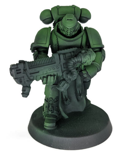
Apply a controlled wash using a brush, all over the miniature, with 4 drops of Game Wash Black Wash 73.201, 3 drops of Game Wash Green Wash 73.205, 6 drops of Thinner Medium 70.524 and 8 drops of Flow Improver 71.362. Thanks to the Flow Improver, the wash settles only in the nooks and crannies of the miniature. It is recommended to use another brush soaked in Flow Improver on the lighter areas of the miniature to ensure that the wash is easily removed from them.