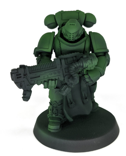
To apply a final highlight, prepare a mixture of 1 part of Game Air Dark Green 72.728 to 2 parts of Game Air Sick Green 72.729. This final highlight is applied with the airbrush to very specific points, further reducing the area sprayed.