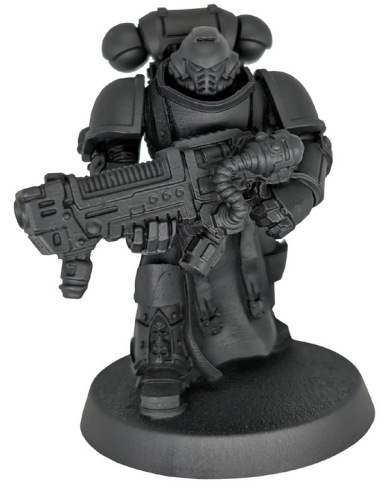
The miniature is primed in black using Surface Primer Black 70.602 or Hobby Paint Spray Black 28.012.