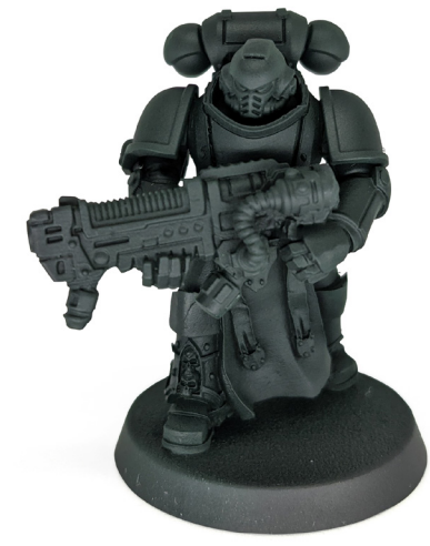
2 Apply Game Air Dark Green 72.728 all over the figure with the airbrush.