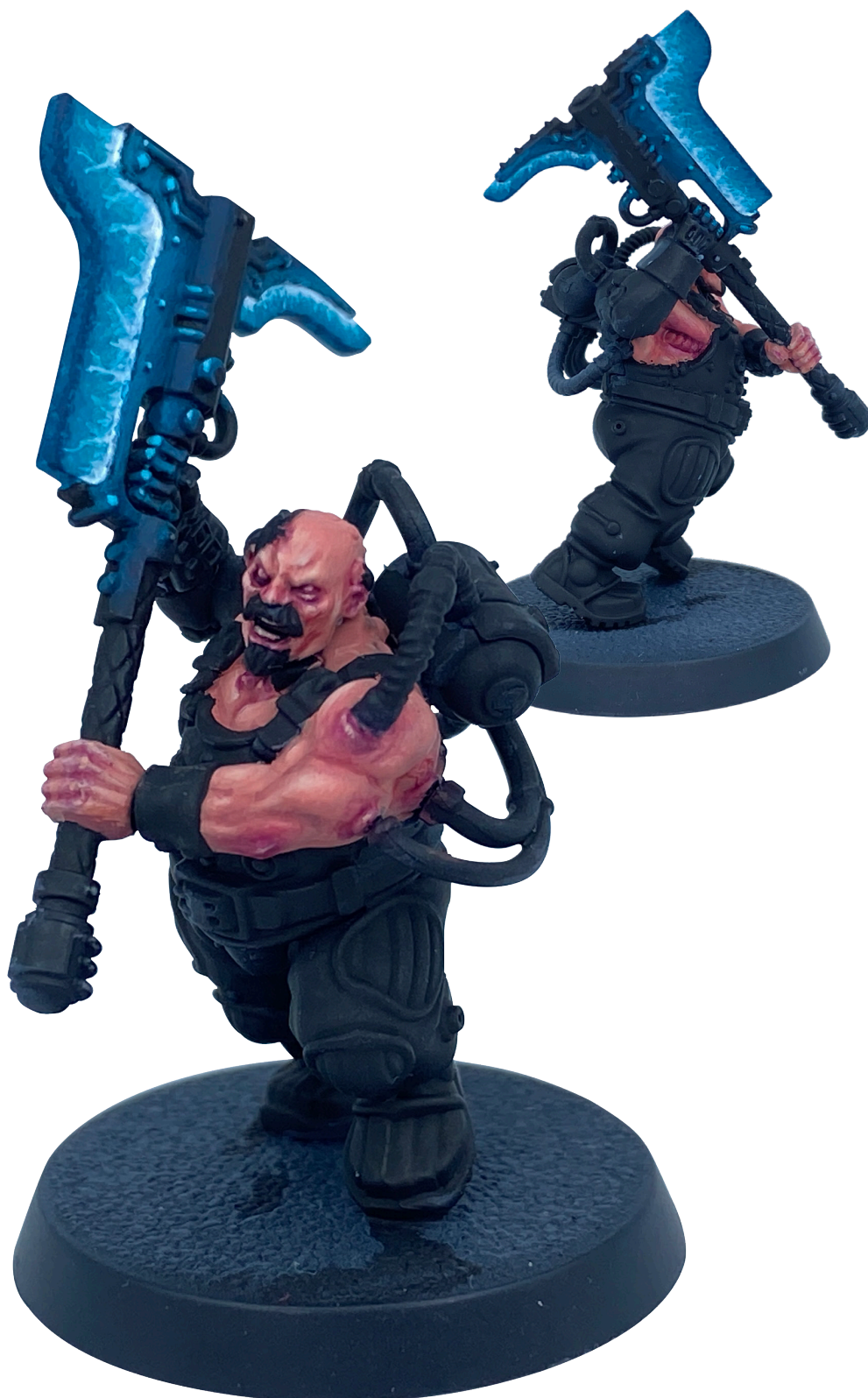
The finished Ice Energy Axe.