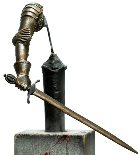
3 The shaded areas are emphasized with undiluted Smoke 70.939. It is applied irregularly to give it the appearance of aged metal.