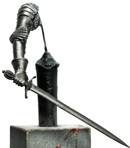
1 A metallic base color is applied with Steel 77.712 over the entire armor of the arm and the sword blade.