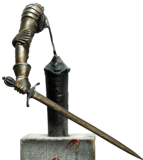
4 The areas of shadow are further darkened with Black Glaze 70.855.