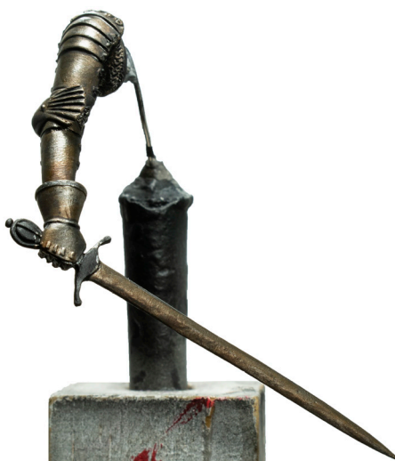
5 Using undiluted Game Ink Black 72.094, the crevices and the spacing between the different elements of the armor are outlined.