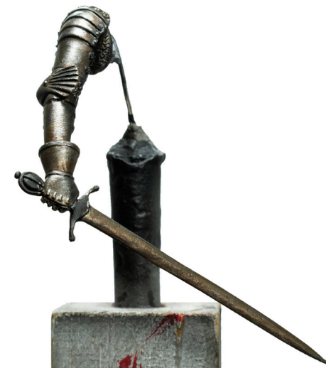
6 The metallic tone of the highlights is restored with Steel 77.712. This is done unevenly to simulate imperfections.